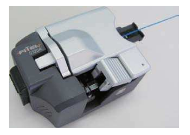
Figure 3 – Precision Fiber Cleaver

There are a wide variety of cleavers (Figure 3) available that will produce thousands of high quality fiber cleaves before requiring maintenance or blade replacement. Ribbon cleavers are similar to the single fiber cleavers but cleave the entire fiber ribbon in one operation (up to 24 fibers).