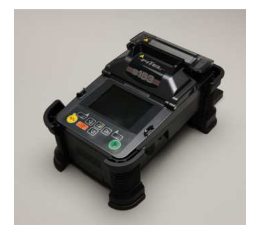
Figure 5 – OFS Fitel® S153A Active Clad Alignment Splicer

3.3 Active Clad Alignment Fusion Splicer: Active clad alignment splicers provide X-Y-Z positioning of the V-grooves to finely position the fiber ends. Consequently, these splicers can compensate for common fixed V-groove splicing errors such as dirty V-grooves and fiber curl. Active clad alignment splicers can achieve a typical splice loss of 0.04 dB for standard single-mode fibers. The splicers are portable, light weight, and can operate using an internal battery. Active clad alignment splicers are commonly used in FTTX, metro, and long-haul applications (Figure 5).