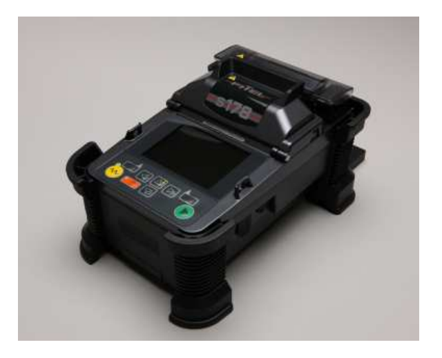
Figure 6 – Fitel S178A Core Alignment Splicer

3.5 Local Injection and Detection Fusion Splicer: Local injection and detection (LID) fusion splicers use a selfcontained optical power injection and detection system to optimize the fiber alignment prior to splicing. The fibers on either side of the splice point are bent around small cylindrical mandrels to allow the injection of light through the fiber coating on the input side and detection on the output side. The fiber alignment is then adjusted to maximize power transmission through the fiber junction. At the point of maximum power transmission, the fibers are fused together thus minimizing the splice loss. Splice loss is displayed after the fusion splice is completed. Typical splice loss for standard single-mode fibers is 0.02 dB.