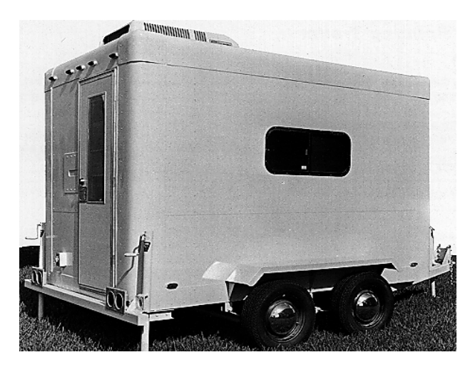
Figure 1 – Splicing Trailer

2.1 Tools and Equipment : In general, an enclosed splicing vehicle or trailer (Figure 1) is recommended for use during optical fiber splicing. Most splicing equipment operates more effectively in a controlled environment that is free of wind, dust, and high levels of humidity. Uncontrolled environmental conditions can negatively affect the splice quality.