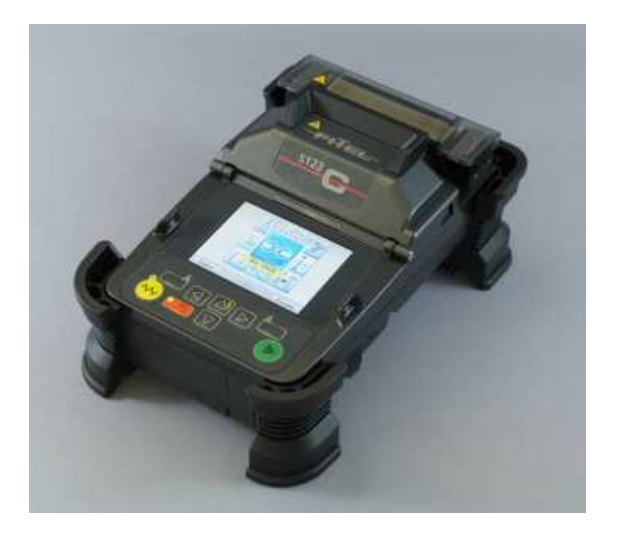
Figure 4 – OFS Fitel® S123C Clad Alignment Splicer

mode fibers. Although the typical splice attenuation is not as low as some of the more sophisticated fusion splicers (e.g., PAS and LID splicers), they are lower cost, small in size, and can typically operate on an internal battery. They are becoming increasingly popular for fiber-to-the-home and emergency restoration applications (Figure 4).